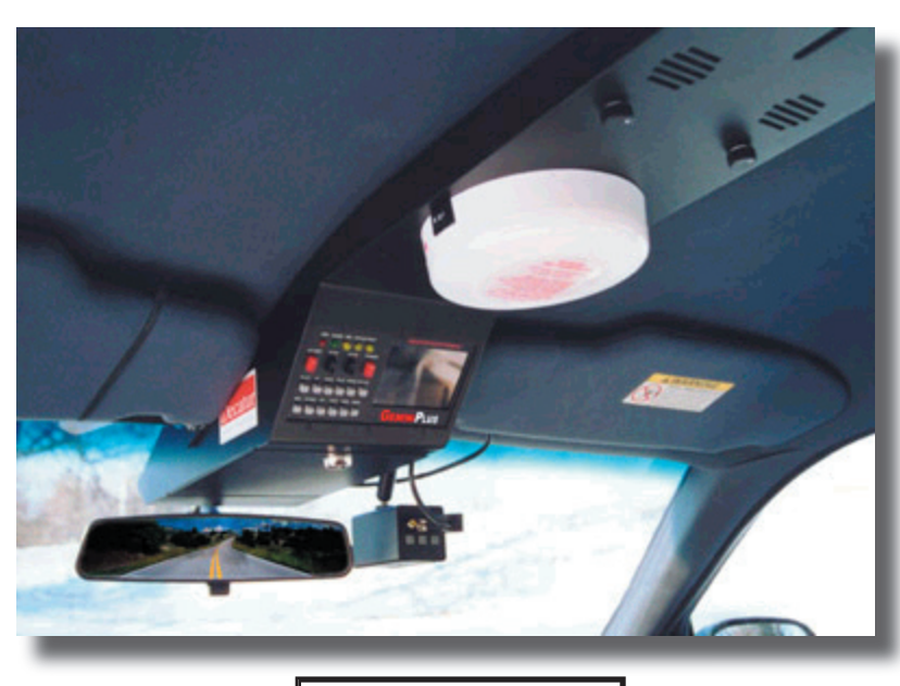
Please call for pricing