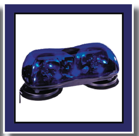
Code 3 LB420, Pg 9