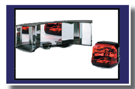
Federal Signal Fire Beam, Pg 4