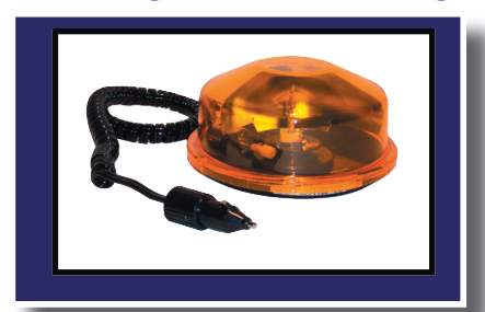
SVP Bryte Lyte, Pg 4

Please note that Manufacturer prices are subject to change without notice