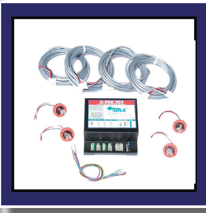
Nova Strobe Kits, Pg 21